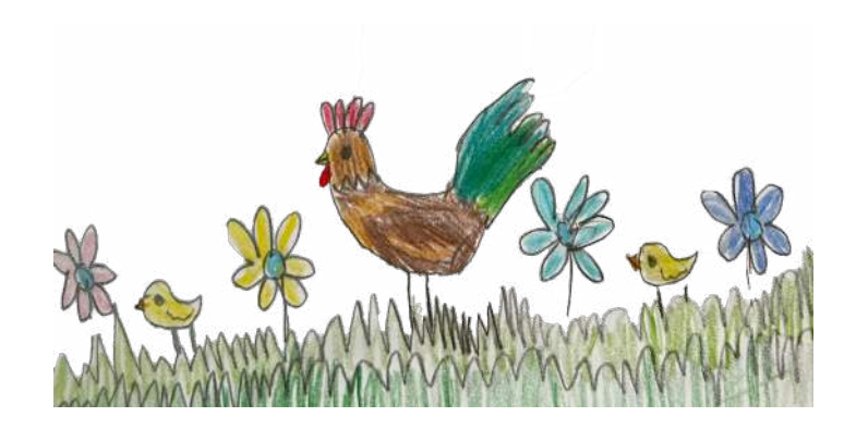
By Nico Holland (granddaughter)

It's now inside silent deskbound Maths everyone!