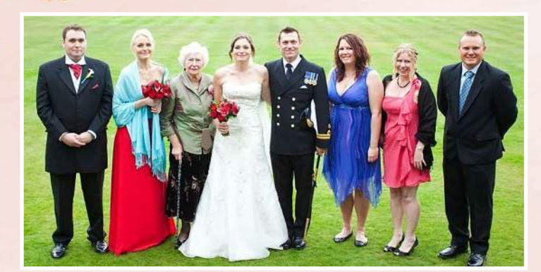
With her grandchildren in the UK, 2010