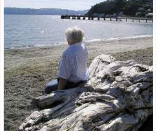
Loving the peace & inspiration of God's handiwork